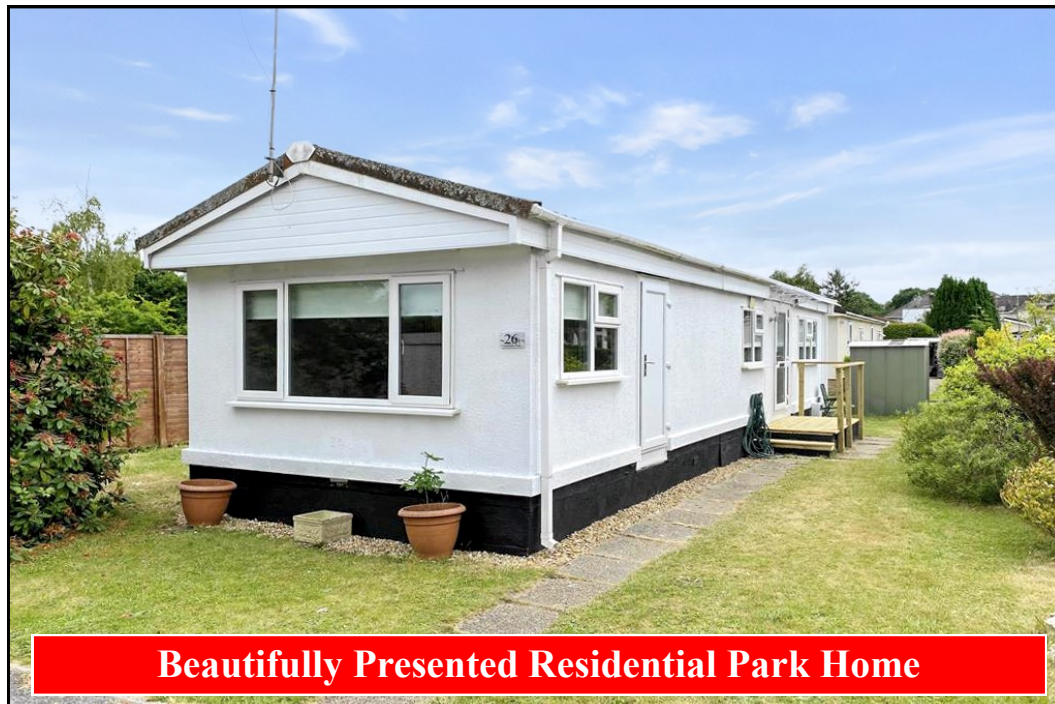
Beautifully Presented Residential Park Home

26 Gladelands Park, Ringwood Road, Ferndown, Dorset. BH22 9BW